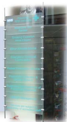
Rod or cable service panels